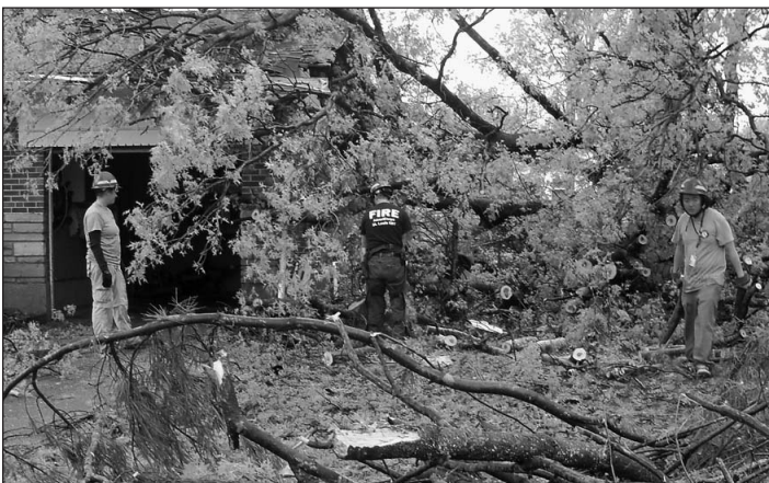
AmeriCorps Volunteers clearing trees from homes.

Many thanks to AmeriCorps St. Louis, an independent federal agency with trained, college age individuals who were on site the next morning. These volunteers worked to clear houses of fallen trees and help get the neighborhoods passable again. They continue to help clear yards of trees and branches.