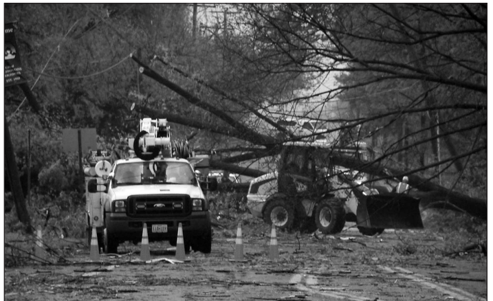
AmerenUE and City of BN crews clearing Bellefontaine Road of trees and power lines the morning after the tornado.

Second, if you live in an area that had damage, watch out for any neighbors who may not be living in their damaged homes. Call the police to check out any suspicious persons, activities or vehicles in these areas. Let's keep the storm victims from being theft victims. Call 911 and have the police check it out.