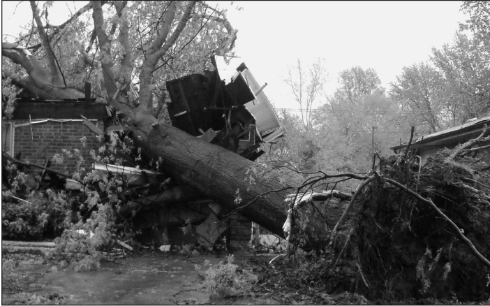
A very large tree crashed into a garage and home.

If you choose to donate to an organization that you are not familiar with, please check them out before you donate. Although there are many good organizations who have the best intentions, there are others who may take advantage of the situation.