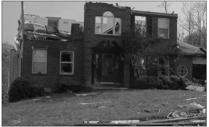
Home with roof and second floor missing.

At the time this newsletter went to the printer, we were working closely with St. Louis County, FEMA and SEMA. We expect to see clean up and construction crews in the neighborhoods for weeks to come. The rebuilding process has started.