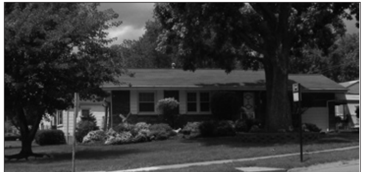
The Slaughter Home 1253 Kilgore