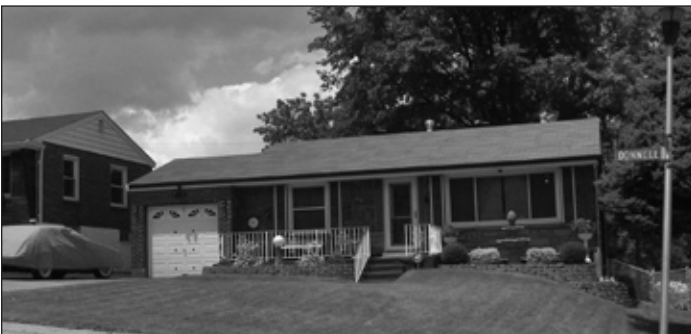
The Isaiah Home 1035 Donnell