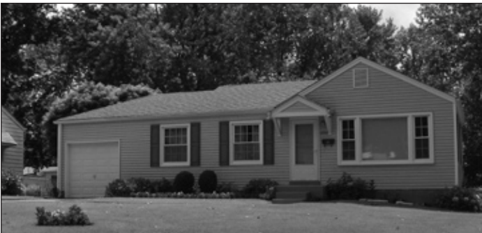
The Slominski Home 1224 Esquire