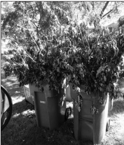
Do Not Overload Totes.