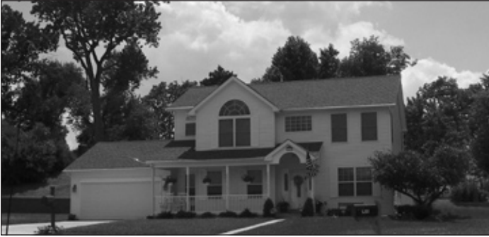
The Kulla Home 1104 La Roux