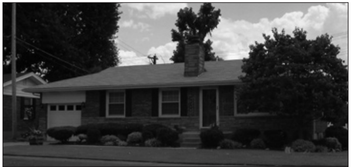
The Groezinger Home 1008 Crete