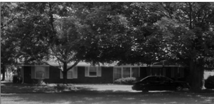
The Griffin Home 1440 Belgrove