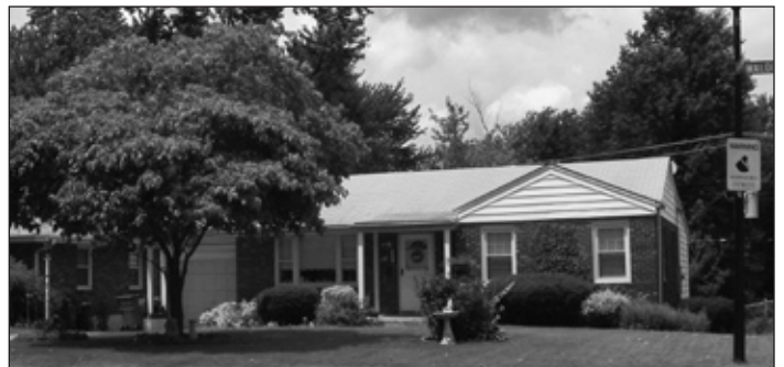
The Corrigan Home 1249 Waldorf