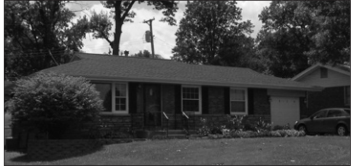
The Sinkfield Home 1218 Billings