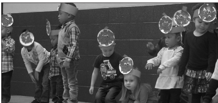
Preschool Class 2014

Grace Chapel has classes for age 3 to 8th grade, sports and tutoring programs and Christian Education. For more information, call 867-6564.