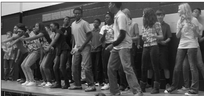
8th Grade Class 2014