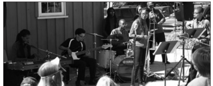
Riverview High School's Point of View Jazz Ensemble

The Bissell House is unusual in that it was occupied by the same family for nearly one hundred and fifty years. Each successive generation made their own alterations and additions. The house was passed on to St. Louis County Parks and has been maintained meticulously as a museum.