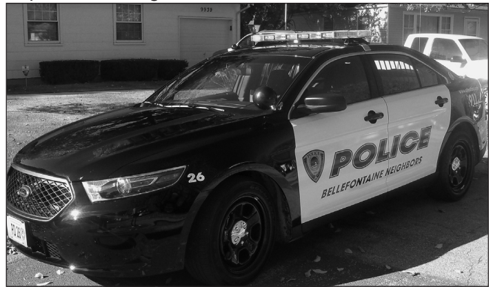
2014 Ford Taurus

resulted in the Police Department receiving related drug forfeiture funds. These drug forfeiture funds allowed the Police Department to purchase needed equipment that was not authorized in the Police Department budget.