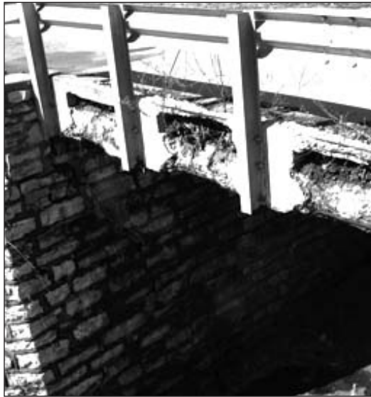
The St. Cyr Road Bridge located on St. Cyr Road between Bellefontaine Road and Lilac is made of lime stone and could have been built as early as the 1920s. The bridge will be replaced in Fall, 2015.

The Shepley Road Bridge is expected to start in early summer and be completed by July 2015. The St. Cyr Road Bridge will include a grant from Great Rivers Greenway to include a bike trail and construction is expected to start in early fall, 2015. Both projects are expected to take 30 days.