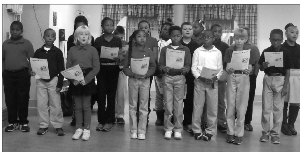
The 4th Grade Choir of Grace Chapel Lutheran School

Administrators work hard to insure that every day is Veterans Day at the Missouri Veterans Home in Bellefontaine Neighbors, but Tuesday, November 11, was extra special. A Veteran's Day Program was sponsored by Fort Bellefontaine American Legion Memorial Post 335, The Missouri Veterans Home and Scott Air Force Base.