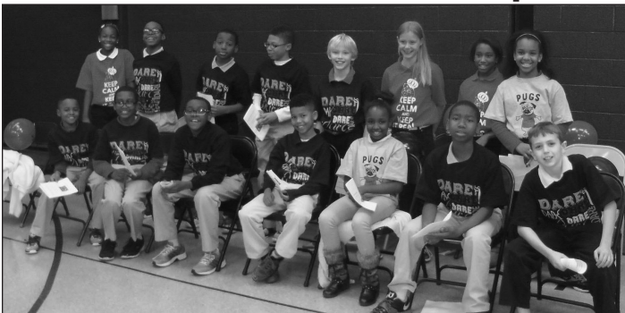
Grace Chapel DARE Graduating Class 2014

The City of BN provides D.A.R.E. Classes to the 5 th Grade Classes at the schools in the City. The students learn about drugs, alcohol, peer pressure and making good choices.