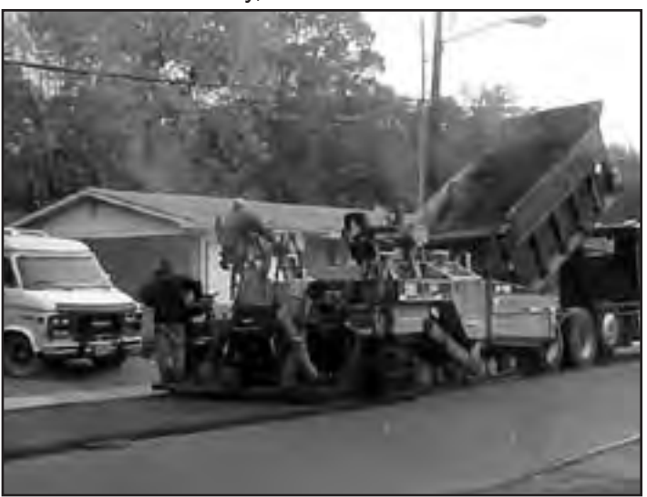
Sherrell Construction Company working to put asphalt overlay on Forest Home Drive.

Work on Phase 1 was halted in December, '09 due to extreme weather conditions and the remaining work is scheduled to resume again in March, 2010. The remaining work in Phase 1 is expected to take approximately three (3) to four (4) months, bringing Phase 1 to an end around July, 2010.