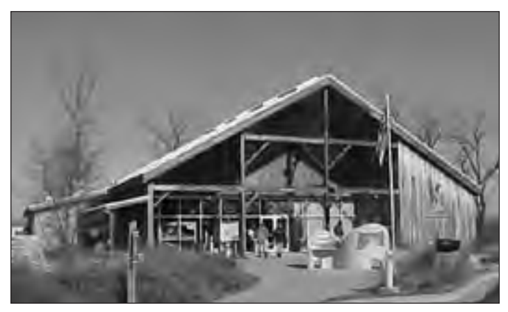
Education And Visitor Center Hours Wednesday through Friday 8 AM - 5 PM Saturday & Sunday 8 AM - 4 PM

CBCA offers bicyclists and walkers a five-mile biking trail and a three-mile hiking trail along the Missouri River. Activities include bird watching, educational programs, canoeing or kayaking and managed hunts. A boat ramp and a fishing pier are located on the Missouri River. Visit the viewing deck at the confluence.