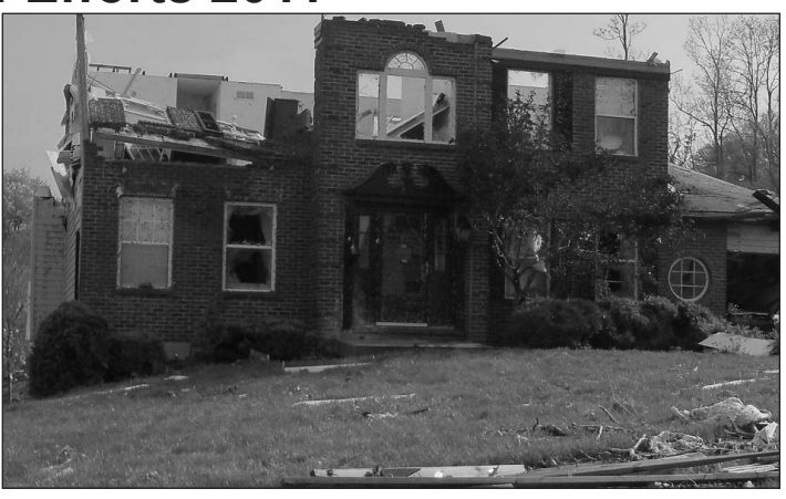
Home with roof and second floor missing.

You can help in many ways. First, be respectful of the privacy and dignity of the owners of the homes that have been effected. Stay away from the damaged areas and let the emergency responders, repair crews, insurance people and construction crews get on with their work.