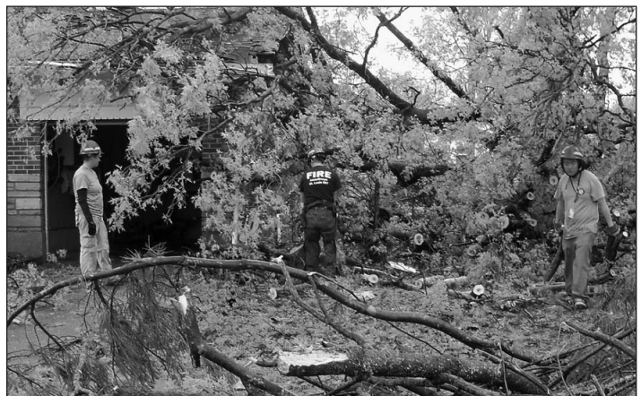
AmeriCorps Volunteers clearing trees from homes.

Many thanks to AmeriCorps St. Louis, an independent federal agency with trained, college age individuals who were on site the next morning. These volunteers worked to clear houses of fallen trees and help get the neighborhoods passable again. They continue to help clear yards of trees and branches.