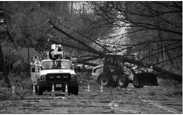
AmerenUE and City of BN crews clearing Bellefontaine Road of trees and power lines the morning after the tornado.

Second, if you live in an area that had damage, watch out for any neighbors who may not be living in their damaged homes. Call the police to check out any suspicious persons, activities or vehicles in these areas. Let's keep the storm victims from being theft victims. Call 911 and have the police check it out.