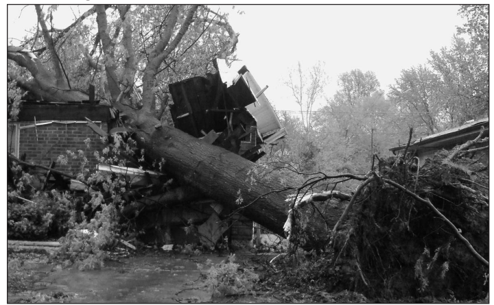
A very large tree crashed into a garage and home.

At the time this newsletter went to the printer, we were working closely with St. Louis County, FEMA and SEMA. We expect to see clean up and construction crews in the neighborhoods for weeks to come. The rebuilding process has started.