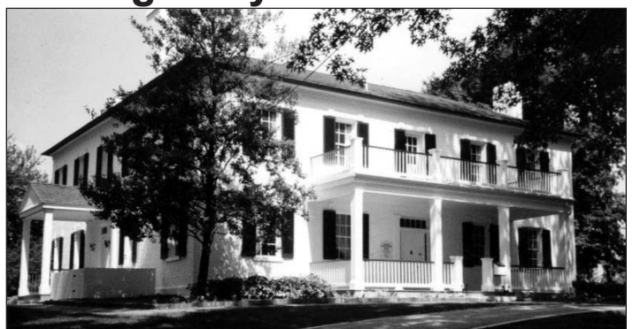
(13+); $2 per child (8-12): and children ages 7 and younger free when accompanied by an adult. Call for tour information on other days.

Guests may view the traveling exhibit at the General Daniel Bissell House at 10225 Bellefontaine Road, St. Louis, MO 63137 or by calling (314) 544-5714, (314) 615-5270 or (800) 735-2966 TTY (Relay Missouri). We encourage you to visit the website at stlouisco.com/parks/Bissell. The exhibit is open each Friday, 12:00 to 4:00 p.m. The cost is $4 per adult