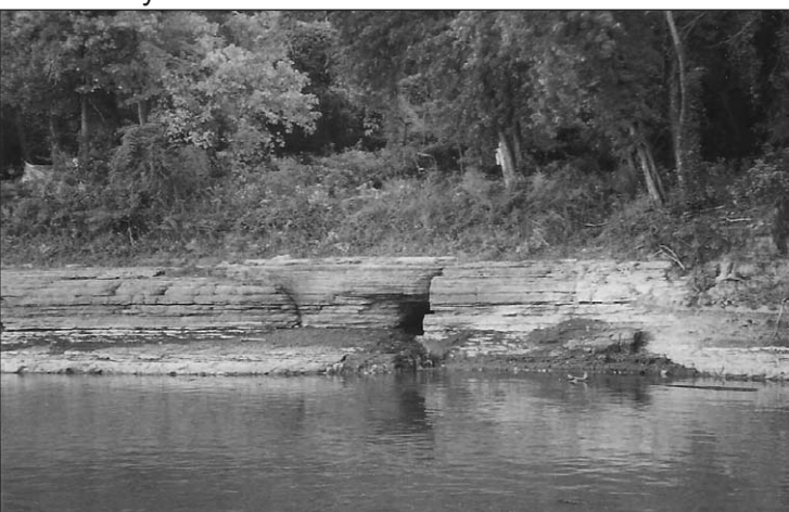
"Belle Fontaine" spring as it looks today.

The French ceded the Louisiana Territory to Spain in 1762 and reclaimed the land in 1800. France had to abandon plans of controlling the territory because of internal problems and sold the entire Louisiana Territory to the United States in 1803 for $15 million or $.03 an acre.