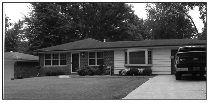
The Elam Home 1146 Siebe Drive