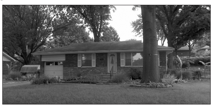
The Sullivan Home 10318 Seaton Drive