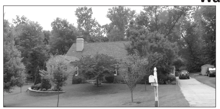
The Johnston-Dagenais Home #5 Green Acres Road