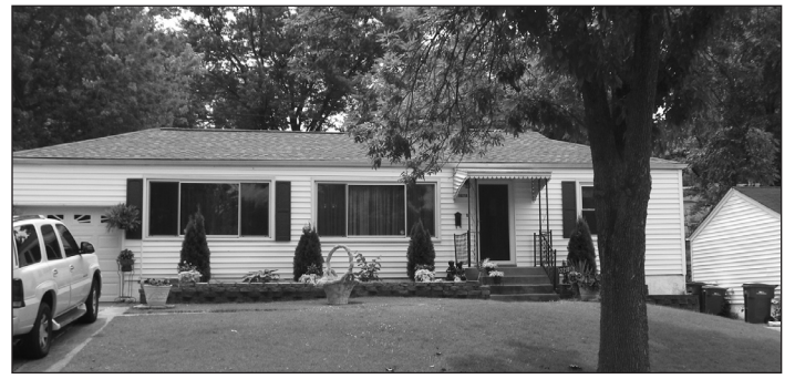
The Herr Home 10218 Coburg Lands Drive