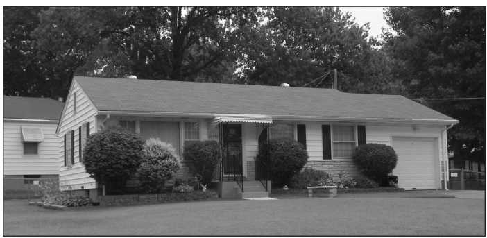
The Conley Home 10446 Ewell Drive