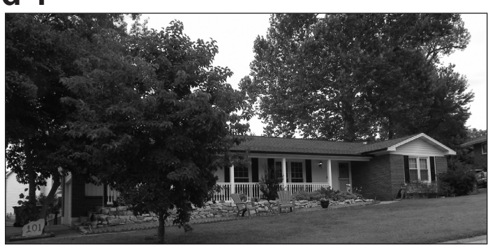
The Whittington Home 101 Green Acres Road