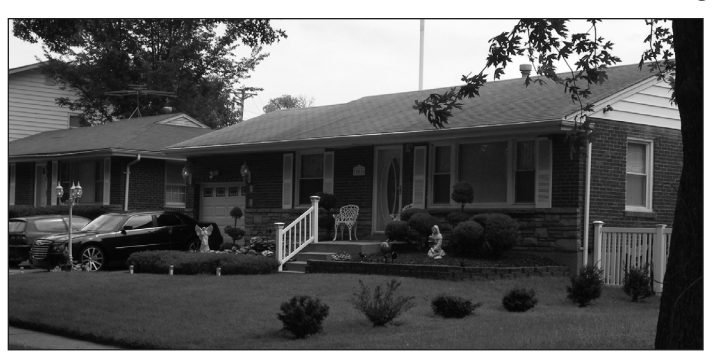
The Buckner Home 10016 Crete Drive