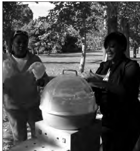
True Redemption Center - Cotton Candy