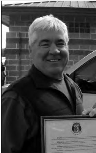
State Senator Tim Green