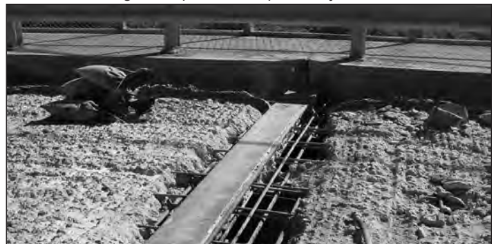
Deteriorating expansion joints