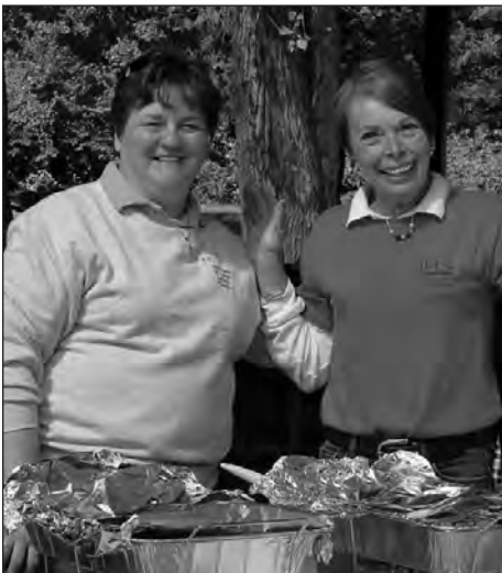
Holy Name of Jesus - "Tacos in a bag"