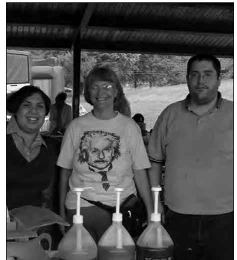
Bellefontaine Baptist - Snow Cones