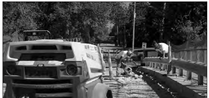
X-L Construction workers removing the pavement on the Shepley Road Bridge to expose the expansion joints and rebar.

The reconstruction on the bridge is scheduled to be completed in mid November.