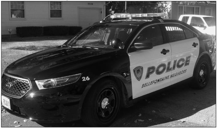
2014 Ford Taurus

resulted in the Police Department receiving related drug forfeiture funds. These drug forfeiture funds allowed the Police Department to purchased needed equipment that was not authorized in the Police Department budget.