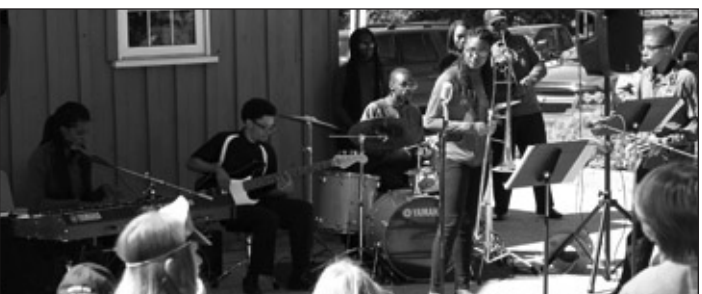
Riverview High School's Point of View Jazz Ensemble