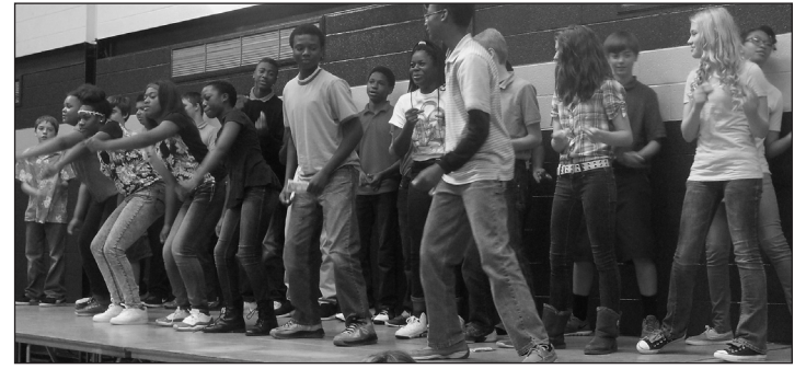
8th Grade Class 2014

sports and tutoring programs and Christian Education. For more information, call 867-6564.