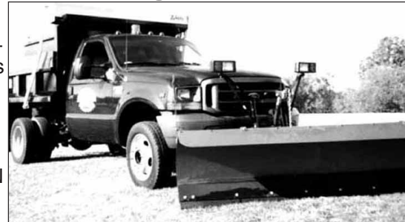
Please keep vehicles off the streets or close to the curb to allow the snow plows and emergency responders to get through.

The City of BN is well prepared for the winter of 2014 -2015, but the price of salt has doubled in the past year. Whenever possible, without compromising safety, the city will attempt to stretch our supply of salt by providing additional plowing and adding sand.