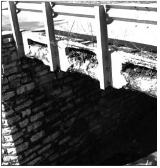
The St. Cyr Road Bridge located on St. Cyr Road between Bellefontaine Road and Lilac is made of lime stone and could have been built as start in early fall, 2015. Both projecarly as the 1920s. The bridge will be replaced

The Shepley Road Bridge is expected to start in early summer and be completed by July 2015. The St. Cyr Road Bridge will include a grant from Great Rivers Greenway to include a bike trail and construction is expected to ects are expected to take 30 days. in Fall, 2015.