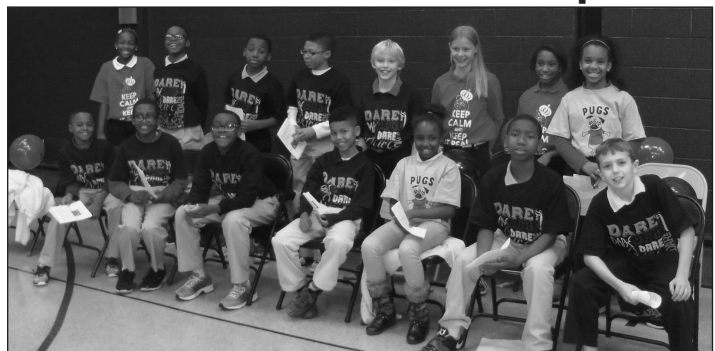
Grace Chapel DARE Graduating Class 2014

The City of BN provides D.A.R.E. Classes to the 5th Grade Classes at the schools in the City. The students learn about drugs, alcohol, peer pressure and making good choices.