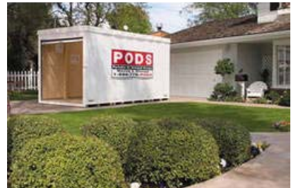
PODS container placed on a driveway

PODS is an enclosed, portable storage container that is delivered to a person’s home for the purpose of moving or storage. Once the PODS is filled with its contents, it is either delivered to its destination or sent to a storage facility. After fourteen (14) days, a PODS container is considered to be a portable shed and, therefore, is subject to St. Louis County ordinances that regulate sheds, including the permitting process for sheds. For County ordinances regarding sheds, please see Sheds/Exterior Storage.