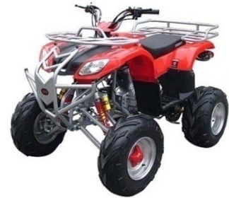
All Terrain Vehicle (ATV)

Contact: St. Louis County Police Department Non-emergency reporting/ General information (314) 889-2341 TDD (314) 889-2345