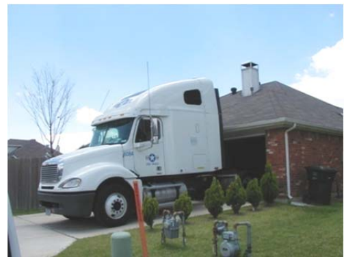
Commercial vehicle parked in residential district

Commercial vehicles weighing more than twelve thousand pounds (12,000) cannot be parked on a residential road or highway between 12:00 midnight and 6:00 a.m. of any day, except in an emergency. Tractors, tractor-trailers, or tractor trailer truck units cannot be parked on any residential road, except while loading or unloading. A standard sized van or pickup, even with commercial markings, is allowed to be parked in residential areas if it is used during regular business hours.